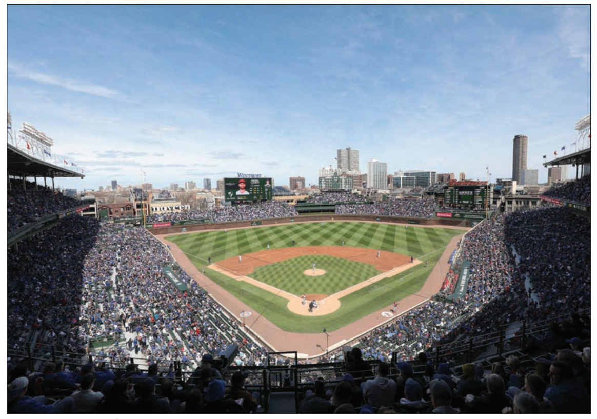
Wrigley Field, home of the major league baseball team Chicago Cubs, is shown in 2019. A case in which an Associated Press photographer was injured at Wrigley while working will not be dismissed.